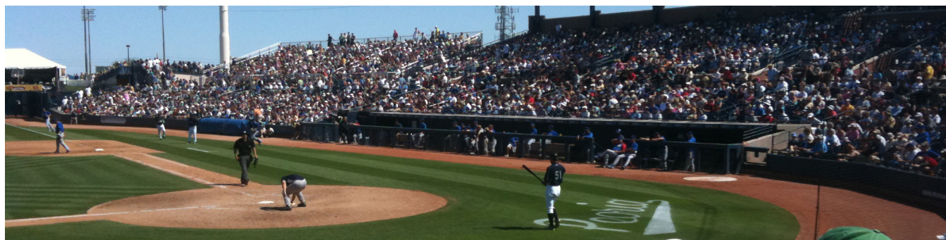
Figure 1: This is a teaser

The Kumquat Consortium jpkumquat@consortium.net